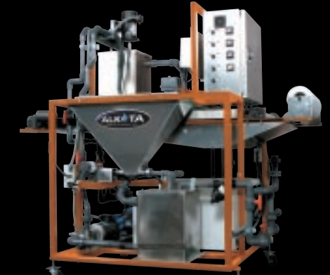
Continuous Flow Floc Skid