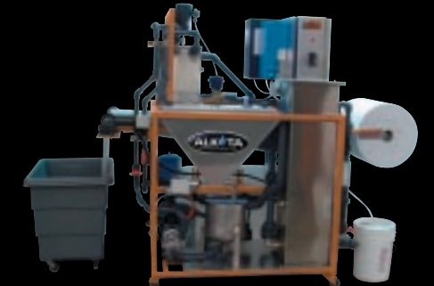
Ozonation Continuous Flow Floc Skid