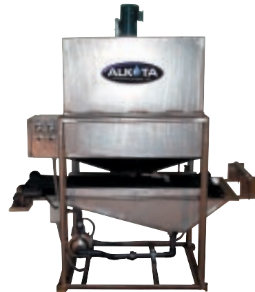
Manual Batch System

Models MB100SS Manual Batch 100 gallon stainless steel MB300SS Manual Batch 300 gallon stainless steel