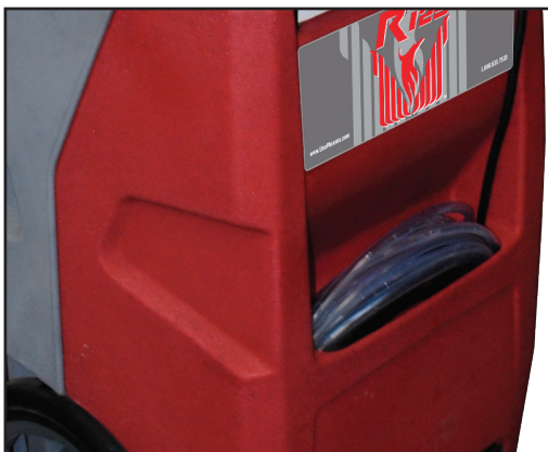
Convenient storage for power cord and drain hose.