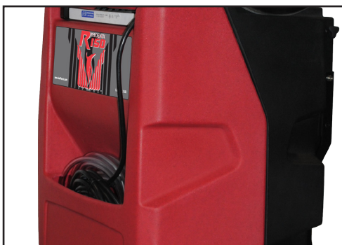
Convenient storage for power cord and drain hose.