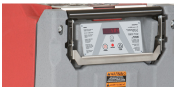
Telescoping handle retracts to make unit compact for transport and storage.

The rugged roto-mold housing resists dents and dings and the granite infused pigment hides scuffs and scratches. The body also features chamfered corners to prevent damage to walls and woodwork while maneuvering on the job-site. Phoenix attention to detail and fore-thought are evident in the R175's ability to stack one upon another for compact storage. An area to accept a company label or identification is located below the R175 emblem. Notched surfaces for tie-down straps and multiple lift points are also inherent in the design of the housing.