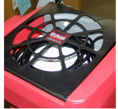
Convenient storage for power cord and drain hose.

The outlet grill is configured to accept a variety of thermo-hygrometer probes (e.g. Vaisala, Humiport, etc.) for taking accurate psychrometric readings. The 20-foot power cord and 33-foot condensate hose store conveniently inside the hinged stainless steel lid.