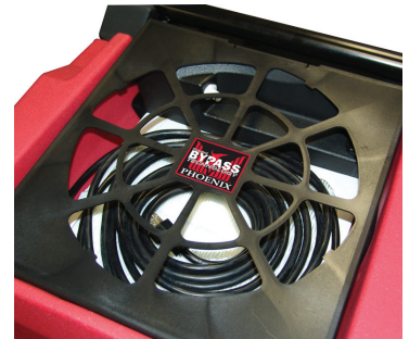
Convenient storage for power cord and drain hose.

The R200 marks Phoenix Restoration Equipment's second entry into the manufacturing of roto-mold LGR dehumidifiers, proving our commitment to technology, performance and durability.