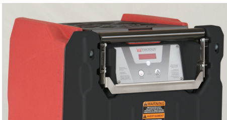
Telescoping handle retracts to make unit compact for transport and storage.